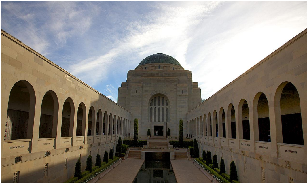
Commemorative Area of the Australian War Memorial

Information obtained from the CWGC & Australian War Memorial (Commemorative Roll)