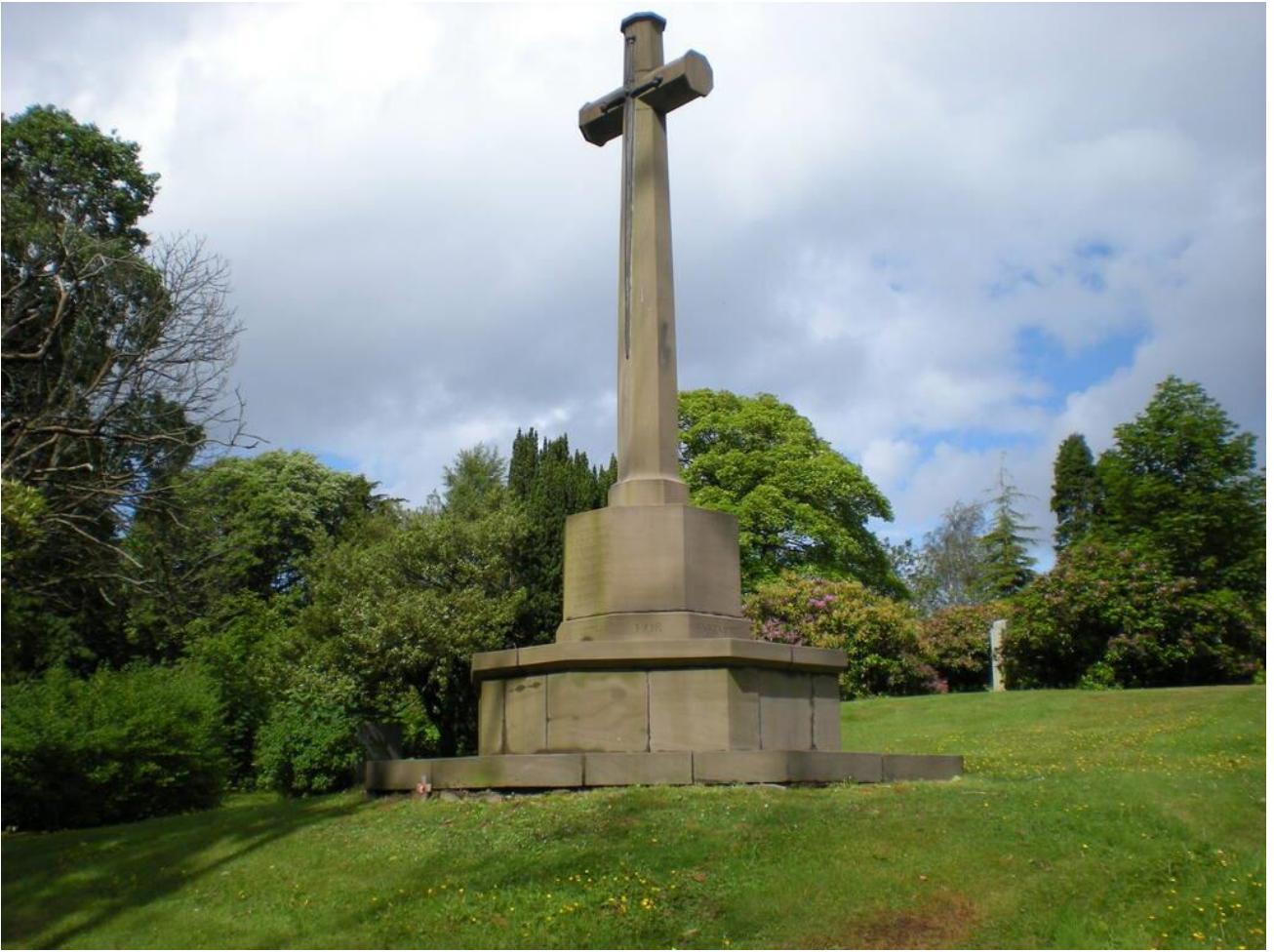
Greenock Cemetery, Scotland