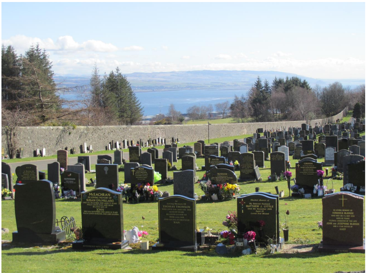
View from newer section of Cemetery